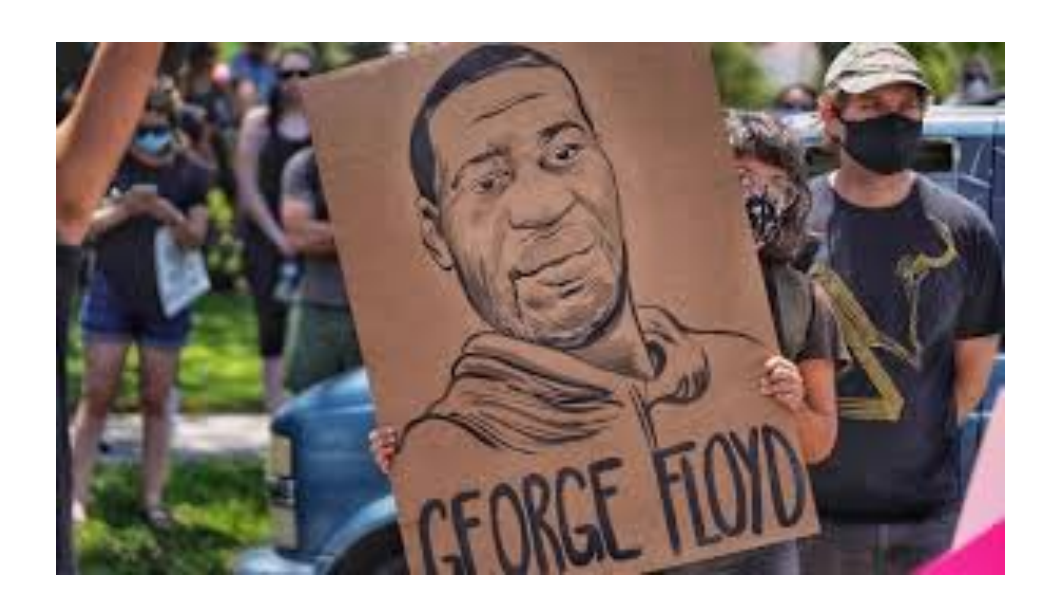
Original version written for <a href="https://www.Anarkismo.net">www.Anarkismo.net</a>