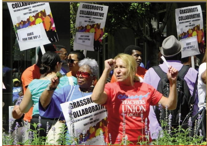
Union teachers and community members demanded TIF taxpayer money go to schools and parks, not multi-million-dollar downtown developments, at a restaurant-themed protest.

In Chicago, the closing and privatization of public schools and health clinics, a drastic reduction in funds for education and public libraries, and major cuts in other social services, including severe cutbacks in Medicaid affecting 2.7 million people in the state, have set the stage for a confrontation between Chicago's political establishment and its teachers. The city's continued allocation of public money to private charter schools and luxury establishments while refusing to finance basic needs for public school children reflects its real priorities. The recent allocation of $29.5 million in TIF money to the River Point Plaza in downtown Chicago is just one example. TIF (tax increment financing) money uses millions of taxpayer dollars to finance projects to benefit private developers rather than using resources to support public schools, parks, and health clinics. The mayor's proposed $5.6 billion school budget allocates $76 million to private charter operators while simultaneously draining Chicago Public Schools' (CPS) reserves down to zero, which downgraded the CPS bond rating. The money Chicago allocates to charters has escalated in recent years from $30 million in 2002 to their current plan of $500 million (half a billion) in 2012. Emanuel's recent revelation that he has set aside $25 million for strike preparations makes clear that he can get his hands on significant funds when he wants to but chooses not to put it into the school system.