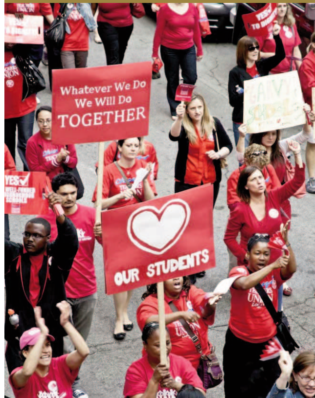
Mass march by Chicago Teachers Union, August 2012.

In today's public schools, low pay, crippling workloads, bad working conditions, and uneducated, interfering bureaucrats force some of the best teachers to leave the profession.