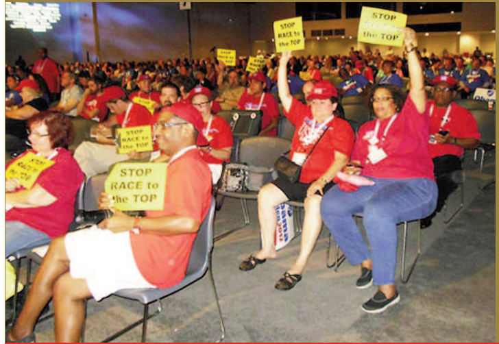
Chicago Teachers Union delegates to the AFT convention (above) refused to wear blue "Obama Biden" teeshirts that were being given away to delegates or hoist the "Obama Biden" signs during a July 29 speech by Vice President Joseph Biden, instead wearing Chicago's distinctive red teeshirts and silently holding up signs reading "Stop Race To The Top."

The crisis in the United States public school system is one part of the decay of the entire infrastructure of the country. Whether