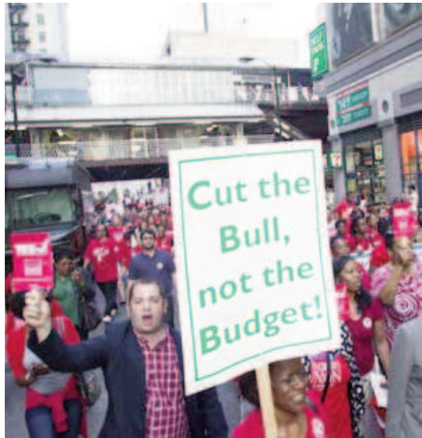
Chicago Teachers Union rally, August 2012.

Flowing from their mistaken and self-serving assumption that the problem with the schools is the teachers, Obama’s RttT weakens teacher unions and to opens the door for privatization of the public schools. Among other things, RttT lifts the caps on charter school openings, ushering in a massive increase in private charter schools. Privatization removes virtually all public control over the schools by putting taxpayer money into the hands of private school corporations and foundations. Accountability goes to the owners who expect to make profits. Over time, charter schools will become an increasing financial drain on public resources, costing taxpayers more than public schools but making no improvement in the education of children.