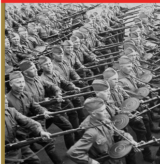
Russian Troops, Second World War