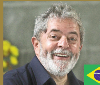
Luiz Inácio Lula da Silva

(2) Sub-Saharan Africa. Here, environmental catastrophe (primarily desertification), poverty, ethnic divisions, weak capitalist classes, poorly developed civil societies and infrastructures, and various legacies of colonialism mean continuing, if not increasing, starvation, mass migration, and civil war. The effects of these disasters will be magnified by