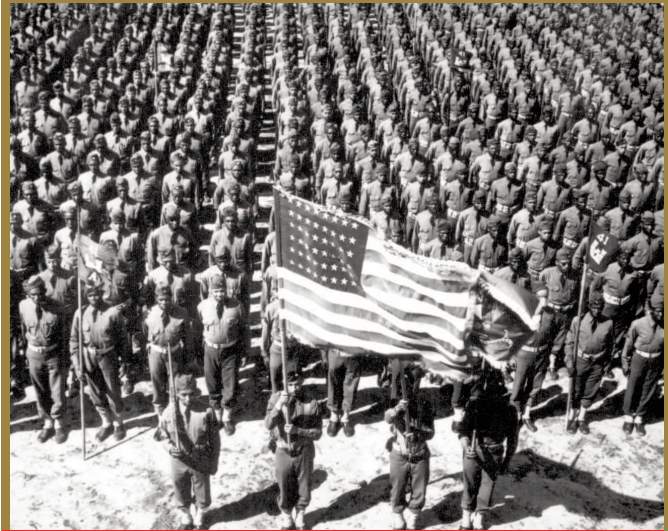
US Troops, Second World War

Yet it was during this time that the seeds of decline were sown, in the form of the transformation of the United States, from what was, in 1945, the world’s most productive and dynamic economy into an increasingly rentier society that had replaced its concentration on manufacturing with a focus on financial manipulation and an obsession with consumption, while financing much of its economic growth through the expansion of debt - governmental, corporate, and private. Today, a mere 20 years after American capitalism seemed to have