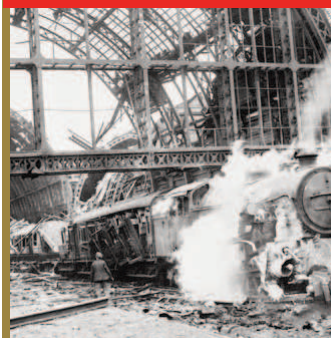
Middlesbrough Station, England

reached its apex, the United States is in a sorry condition, slowly recovering from a crippling economic crisis and faced with tremendous social problems and visibly eroding international influence. Its European allies are in perhaps even worse shape, their governments burdened with colossal debts and the Euro zone in danger of flying apart. During this same period, some of the previously colonial and semi-colonial countries, particularly China, India, and Brazil, experienced dynamic economic growth and began to transform their societies economically and socially, greatly increasing their regional and (particularly in the case of China) global influence.