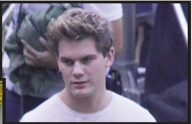
"Independence Day" and "The Day After Tomorrow," as well as for an unintended disaster, "Anonymous," about who really wrote Shakespeare). The movie is structured so that it climaxes with the first night of the four-day Stonewall rebellion and, after more plot business, the first Gay Liberation march up New York's Fifth Avenue on the rebellion's first anniversary in 1970. The message of gay pride is loud and clear, and it's good to be reminded that protest violence is

justifiable, can get results, and can lead to, rather than interfere with, organized protest. All this is positive. The movie was criticized before release for centering on a white character when the rebellion was multiracial, and for not using any trans actors, but while both points have some merit, the first is too narrow and the second doesn't relate to "Stonewall's" artistic vision.