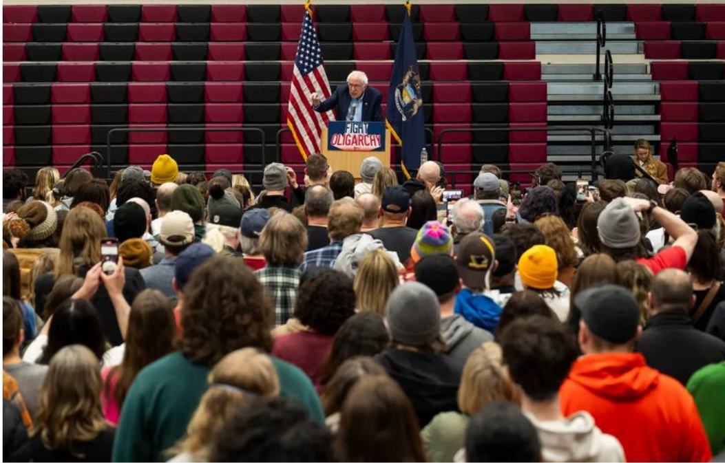
U.S. Sen. Bernie Sanders speaks during a stop on his Fighting Oligarchy: Where We Go From Here tour on Saturday, March 8, 2025 at Lincoln High School in Warren.