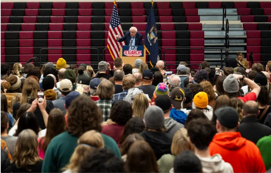
U.S. Sen. Bernie Sanders speaks during a stop on his Fighting Oligarchy: Where We Go From Here tour on Saturday, March 8, 2025 at Lincoln High School in Warren.