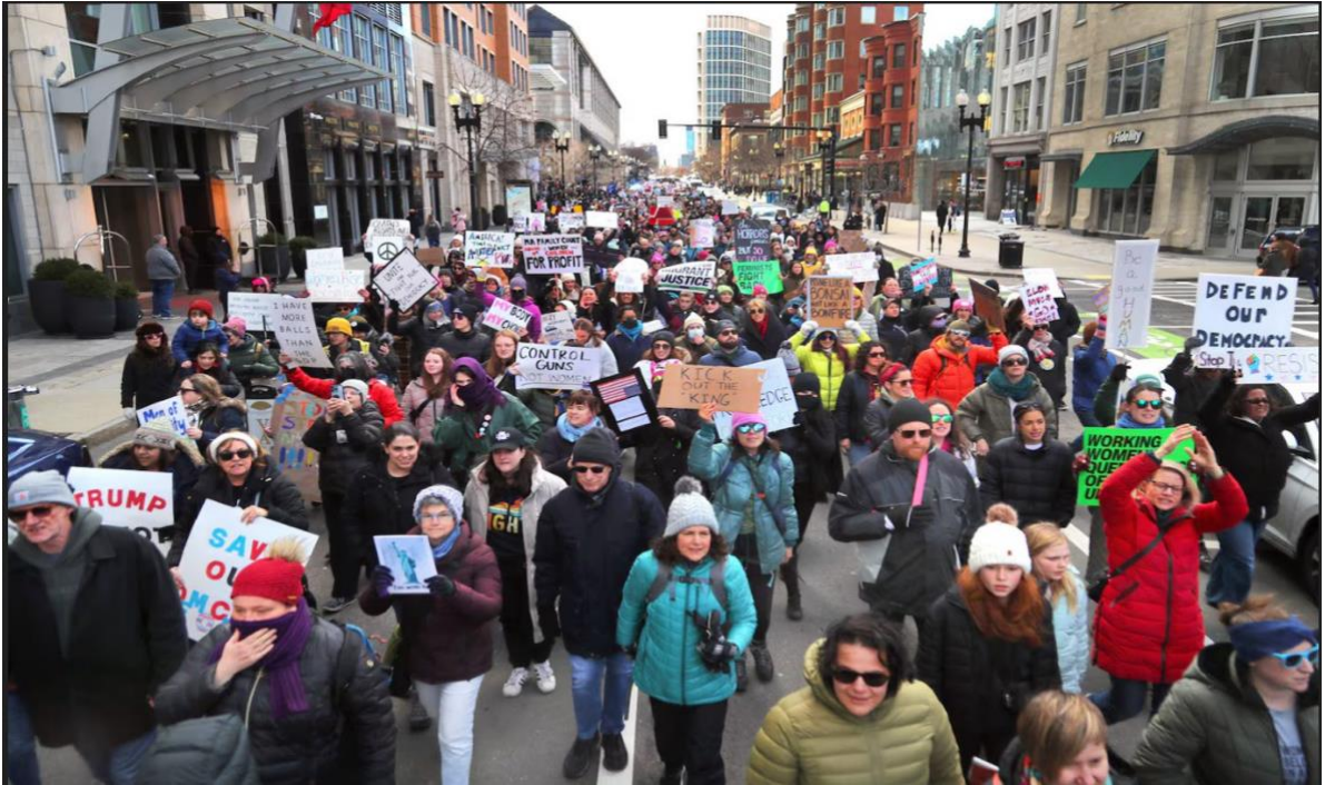
Santa Fe, NM Teachers and Students